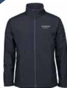
Soft Shell Jacket